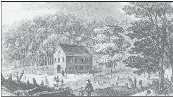
ORIGINAL CHURCH FROM A DRAWING BY WILLIAM ALLAN